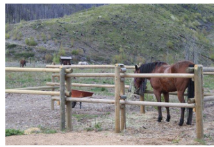
Corrals at Fish Trap Creek

Visit HCBC's online bookstore at www.hcbc.ca for more great books!