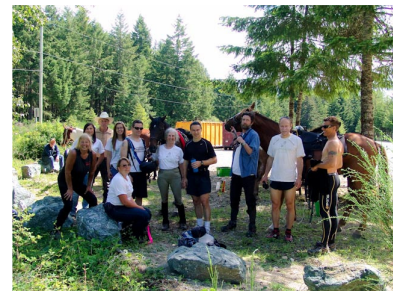
VISTA at Glenora

north of Kinsol trestle where the horses and runners parted ways. The runners then carried onto Victoria.