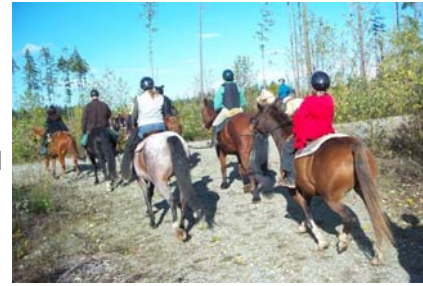
Silver Spur Riding Club

HCBC member Clubs who are working on trail, trailhead and horse camp projects to assist with the financing of materials and/or labor costs for these projects. The application process will be announced sometime in March. Stay tune!