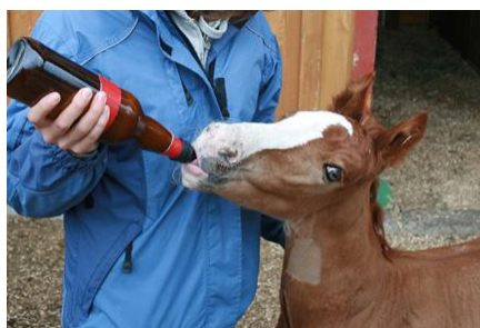
Chance - Bottle Feeding at 12 Days Old