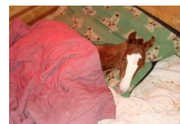
Chance - 1 Day Old

"By some strange twist of fate I actually had an amount of colostrum in my freezer from one of my mares that had lost a foal, so I brought it with me." says Lea.