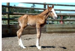
Chance - 2 Days Old Weak But Standing

While Lea and one of the ESL students were making their way back with the colt, the rest of the students were at the ranch busily preparing a stall with bedding and heat lamps for added warmth.