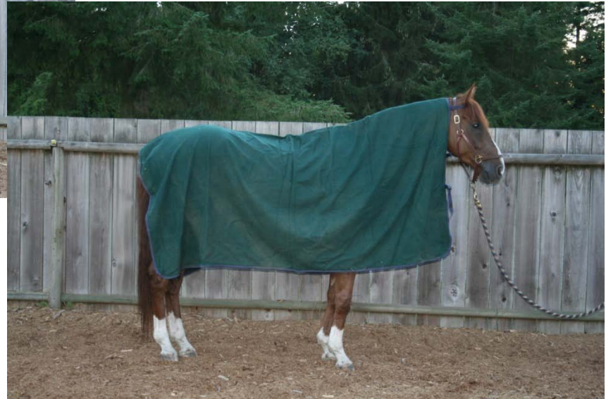
Full wool cooler

Coolers are used to help cool out and dry a horse after work. They are also used to provide warmth to the horse while in its stall or being walked.