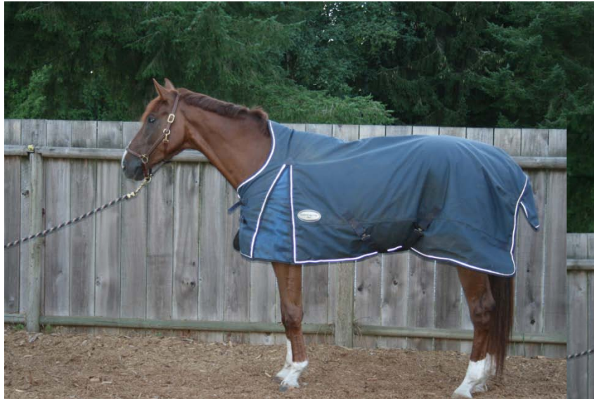
High neck turn out