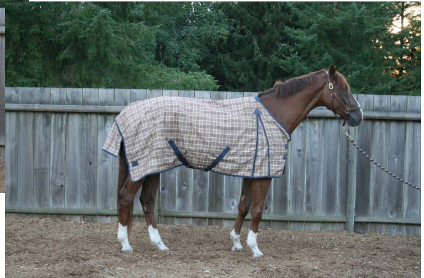
Quilted blanket liner

These blankets are used to provide warmth. The liner can be used alone to provide warmth in the stall or under a waterproof rain sheet . A stable blanket is used to provide warmth while the horse is stabled or for turnout in dry weather.