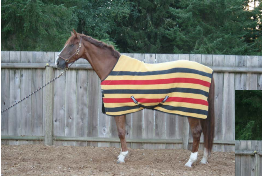
Fleece fitted cooler