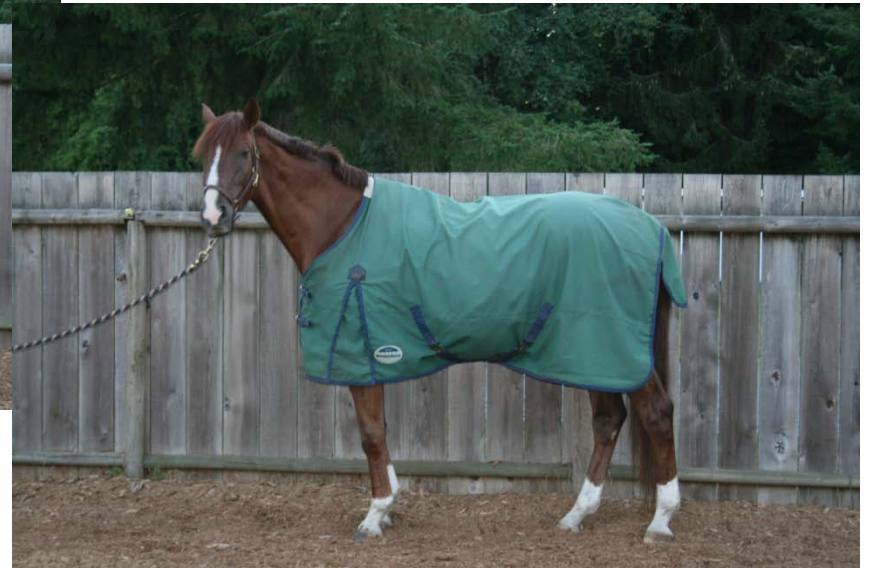
Regular neck turn out

Turnout blankets provide warmth and protection from rain to the horse while outside. They come in a variety of weights and fills, and should be waterproof.